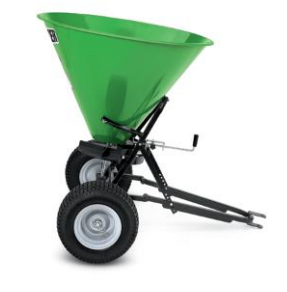
SS1035B Broadcast Spreader