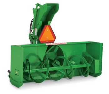
SB2176 Snow Blower

For more information, including detailed features and specs, visit JohnDeere.com/Frontier or JohnDeere.ca/Frontier.